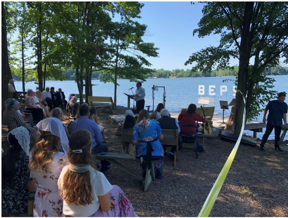
Slavic church from Montpelier that uses our lakefront for Baptisms.