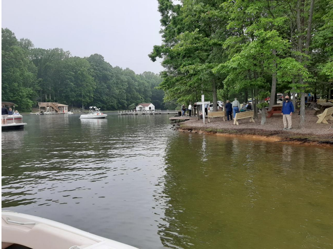
worshiping by boat - the ultimate social distancing