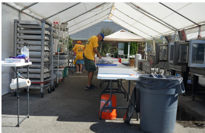
Disaster Response Feeding Unit volunteer training