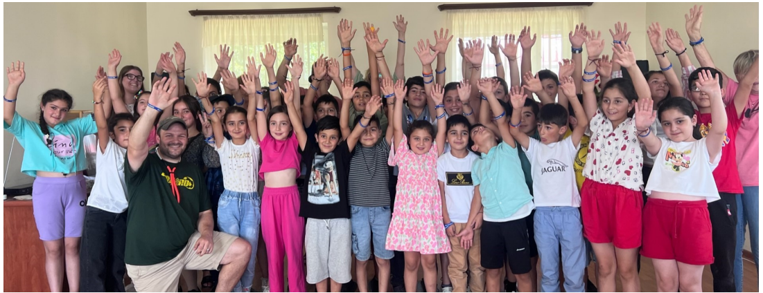
The children were excited to show their bracelets which read “Jesus Loves Me” in English and Armenian. These special bracelets (350) were donated by an individual at Oakland Baptist.

Oh, and by the way, Hallelujah and Amen translate really easily into Armenian.