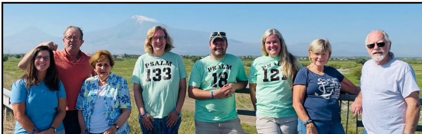
Goshen's Mission Team to Armenia with Mt. Ararat in the background. See pages 5-6 for stories from the team.